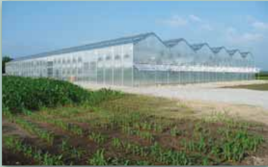
In early 2009, we'll begin using our new, high-efficiency greenhouse. And next spring—thanks to our loyal customers—Meadow View will be celebrating 25 years in business.

While you were tending this past summer's flower beds, we at Meadow View were looking ahead to the gardens you'll be taking care of in 2009.