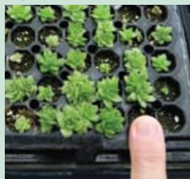
This photo of hens and chickens was taken in June in our propagation greenhouse.

Perennials need to go through a cold cycle (called vernalization) in order to bloom. So when you're weeding your flower beds and barbecuing in the back yard, we're carefully tending next year's crop so they'll be ready to bloom and flourish for you.